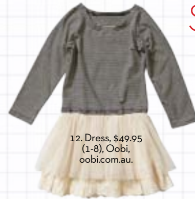
12. Dress, $49.95 (1-8), Oobi, oobi.com.au.

The kids always look fresh and bright in Oobi (12).