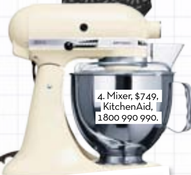
4. Mixer, $749, KitchenAid, 1800 990 990.