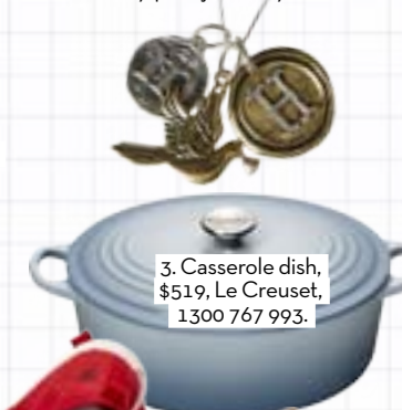
3. Casserole dish, $519, Le Creuset, 1300 767 993.