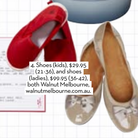
4. Shoes (kids), $29.95 (21-36), and shoes (ladies), $99.95 (36-42), both Walnut Melbourne, walnutmelbourne.com.au.