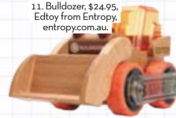
11. Bulldozer, $24.95, Edtoy from Entropy, entropy.com.au.