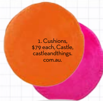
1. Cushions, $79 each, Castle, castleandthings.com.au.

These sandwich keepers come in a different colour for each day of the school week, making lunch time fun and eco friendly (12).