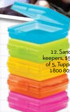
12. Sandwich keepers, $58 for set of 5, Tupperware, 1800 805 396.