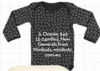
3. Onesie, $43 (3-24mths), New Generals from Minibots, minibots.com.au.