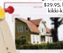
5. Memory book, $29.95, Kikki.K, kikki-k.com.