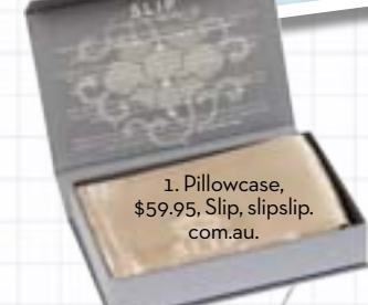
1. Pillowcase, $59.95, Slip, slipslip.com.au.