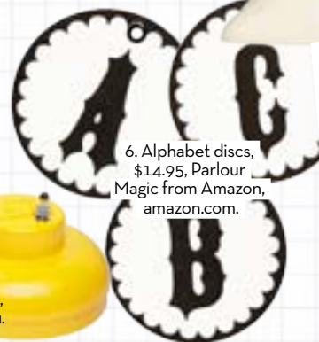
6. Alphabet discs, $14.95, Parlour Magic from Amazon, amazon.com.