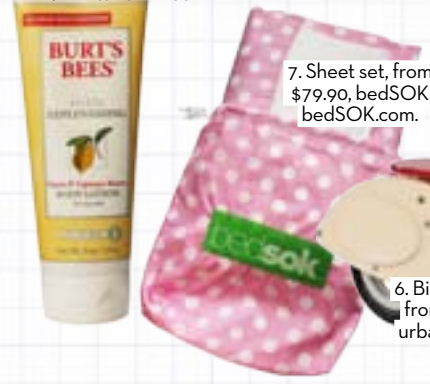
7. Sheet set, from $79.90, bedSOK, bedSOK.com.