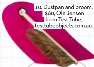
10. Dustpan and broom, $60, Ole Jensen from Test Tube, testtubeobjects.com.au.