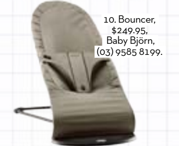
10. Bouncer, $249.95, Baby Björn, (03) 9585 8199.