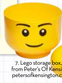
7. Lego storage box, $29, from Peter's Of Kensington, petersofkensington.com.au.