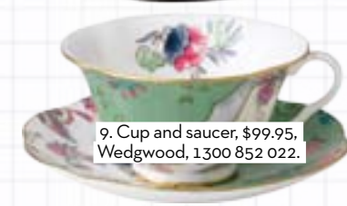
9. Cup and saucer, $99.95, Wedgwood, 1300 852 022.