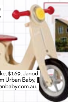
6. Bike, $169, Janod from Urban Baby, urbanbaby.com.au.