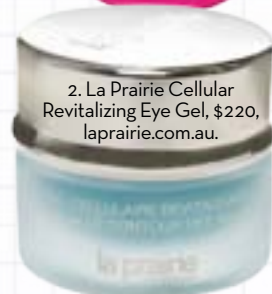
2. La Prairie Cellular Revitalizing Eye Gel, $220, laprairie.com.au.